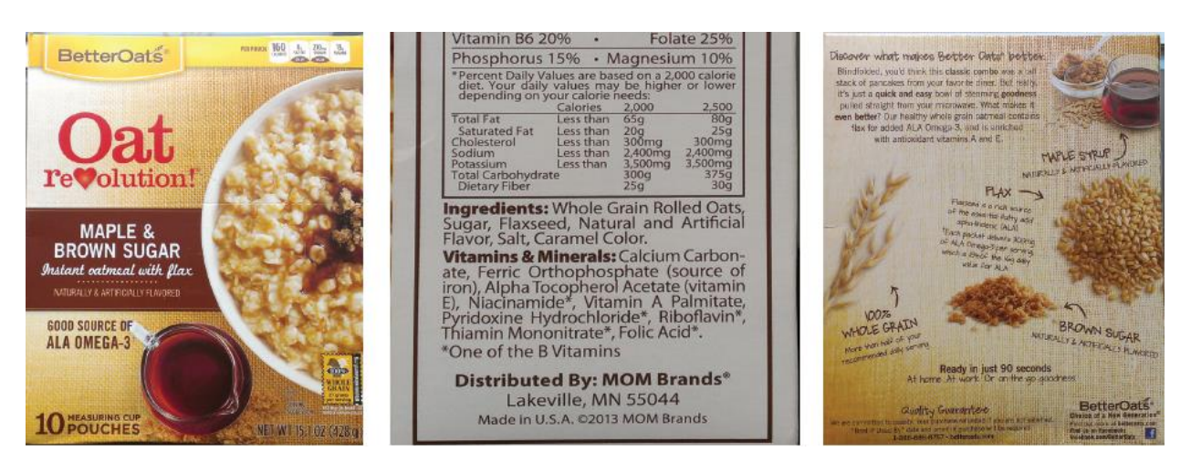
Figure 1: MOM Brands' Better Oats Maple & Brown Sugar Instant Oatmeal with Flax