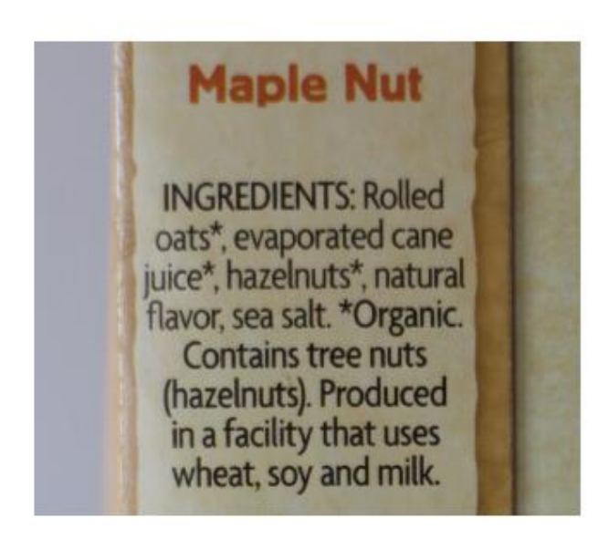
Figure 2: Nature's Path Organic Maple Nut Hot Oatmeal