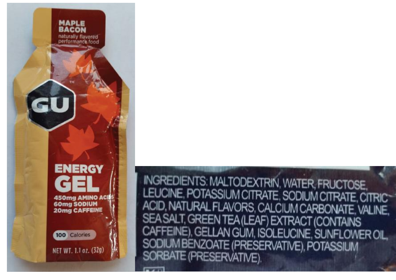
Figure 7: GU Maple Bacon Energy Gel