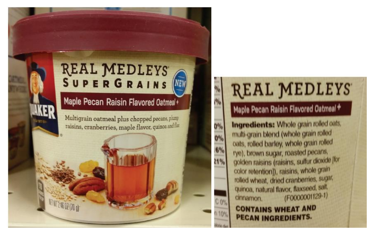
Figure 8: Quaker Oats Maple Pecan Raisin Flavored Oatmeal